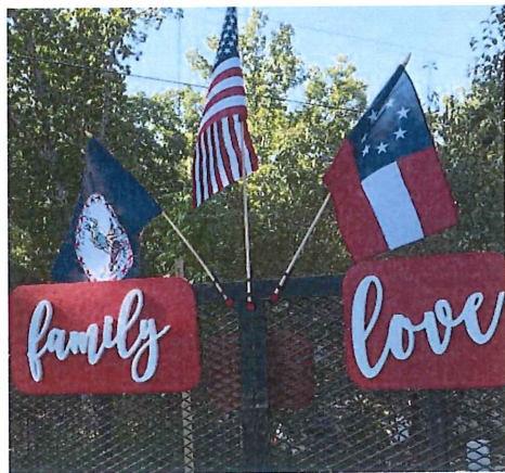
Flags on rear of trailer from Railroad Festival.