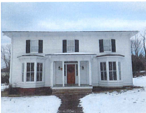
(Left): The Charles G. Trevilian House, Louisa, VA