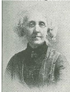
Letitia Tyler Semple

She was the daughter of President John Tyler and living in New York when the war began. Her husband joined the ship CSS Alabama and she headed to Richmond to offer medical assistance. With soldiers becoming sick from diseases, it became apparent that there was a need for an establishment of hospitals. She wilset up the first Confederate hospital in Williamsburg, Virginia. Because her father was a member of the Confederate Congress, she was able to obtain medical supplies. Her experience will help others to open more hospitals as the war progresses.