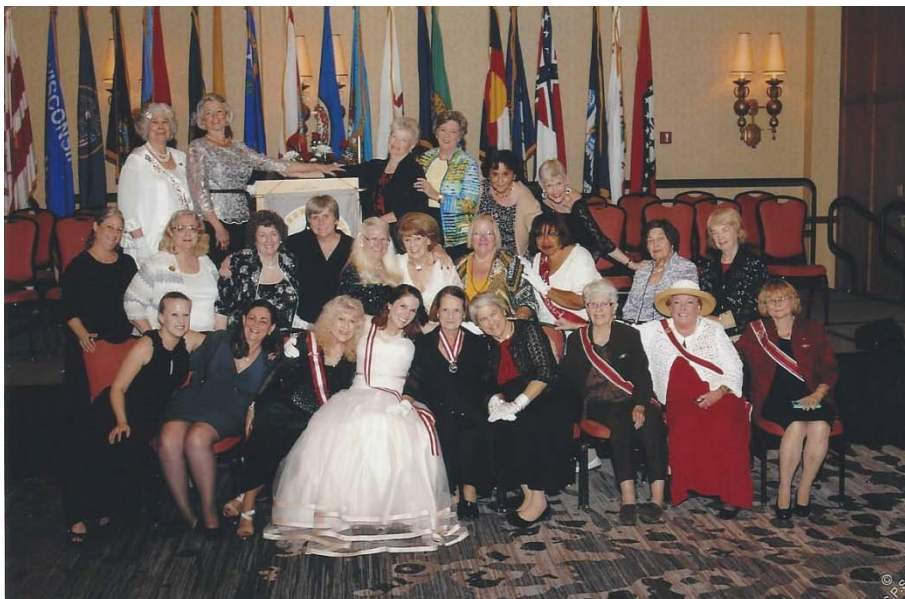
Virginia Division on President's Evening at General Convention