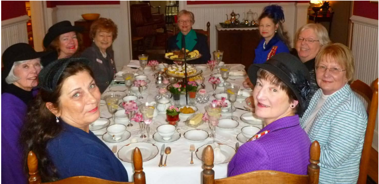
January's Lee-Jackson-Maury Tea