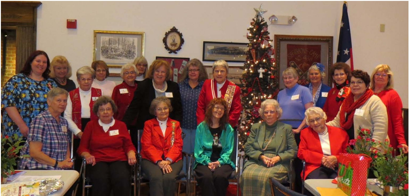
The December meeting of Turner Ashby Chapter 162.

For our December meeting, Chapter members enjoyed a wonderful Christmas Tea held at the Historical Society Museum in Dayton, Virginia. Everyone enjoyed a delicious Tea and then took part in decorating a Christmas Tree with paper ornaments with our Confederate ancestors names on them. The tree was beautiful and stayed in the Museum throughout the Christmas Holiday.