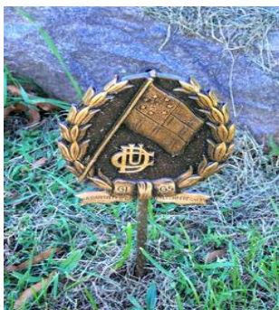
Grave marker signifying she was a UDC member