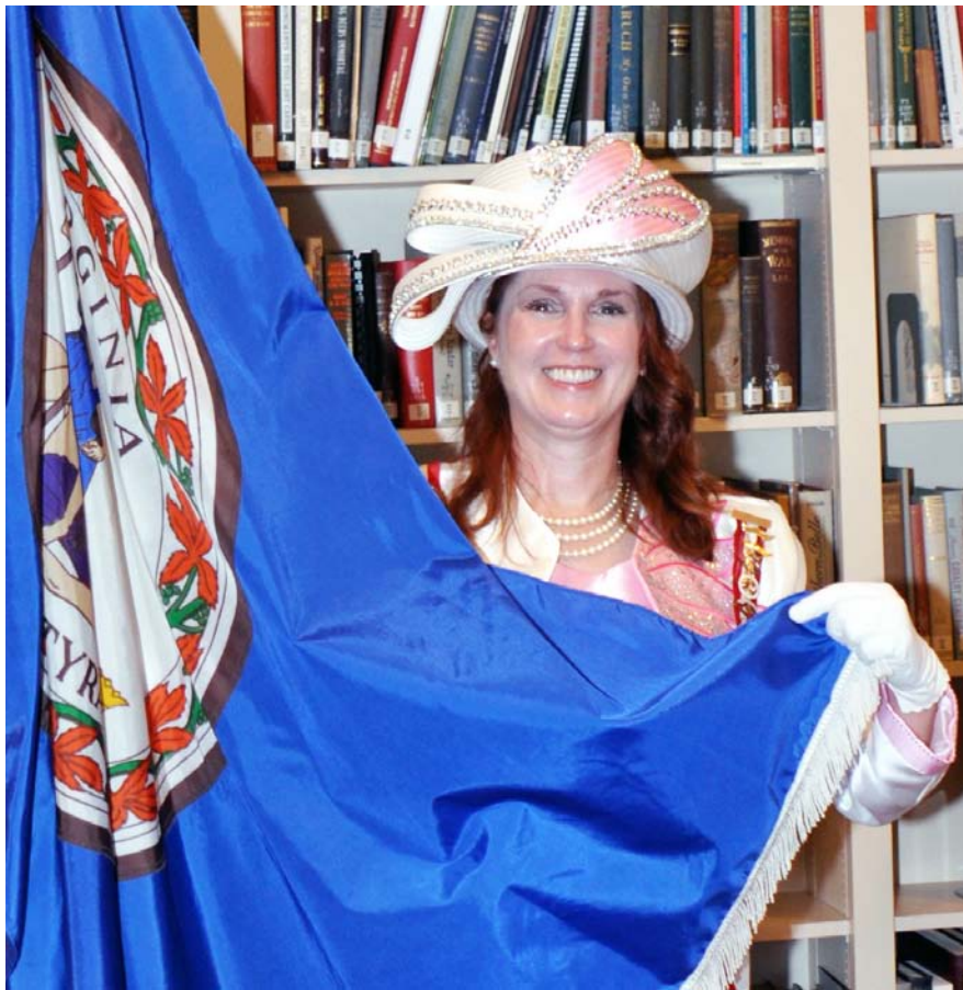
At the Massing of the Flags